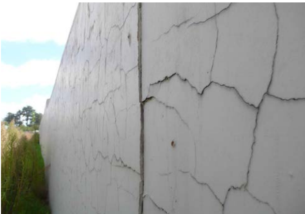
Photo 1000984. Cracking and adhesion failure of plaster next to a movement joint in an inadequately water-proofed, exposed wall, caused by expanding clinker brickwork containing excessive amounts of sulphate

The following photographs illustrate the cracking and spalling that could occur in a moist plastered wall built with clinker bricks, which contain excessive amounts of sulphate.