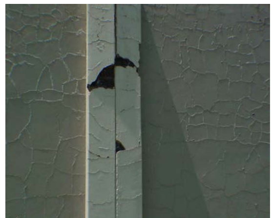
Photo DSC01139. An inadequately water-proofed, plastered wall built with clinker bricks, which contained undue amounts of sulphate. Note the excessive crazing and the efflorescence in and paint failure along the cracks as well as spalling of plaster from a column due to expansion of the brickwork.

Something which is not always understood is that sulphate or moisture or both have to be present for sulphate expansion and efflorescence to take place. If one of the two was eliminated, it cannot occur. This means that it is also important that walls are properly waterproofed (refer in this regard to SANS 021: Code of practice for the waterproofing of buildings, including damp-proofing and vapour barrier installation ).